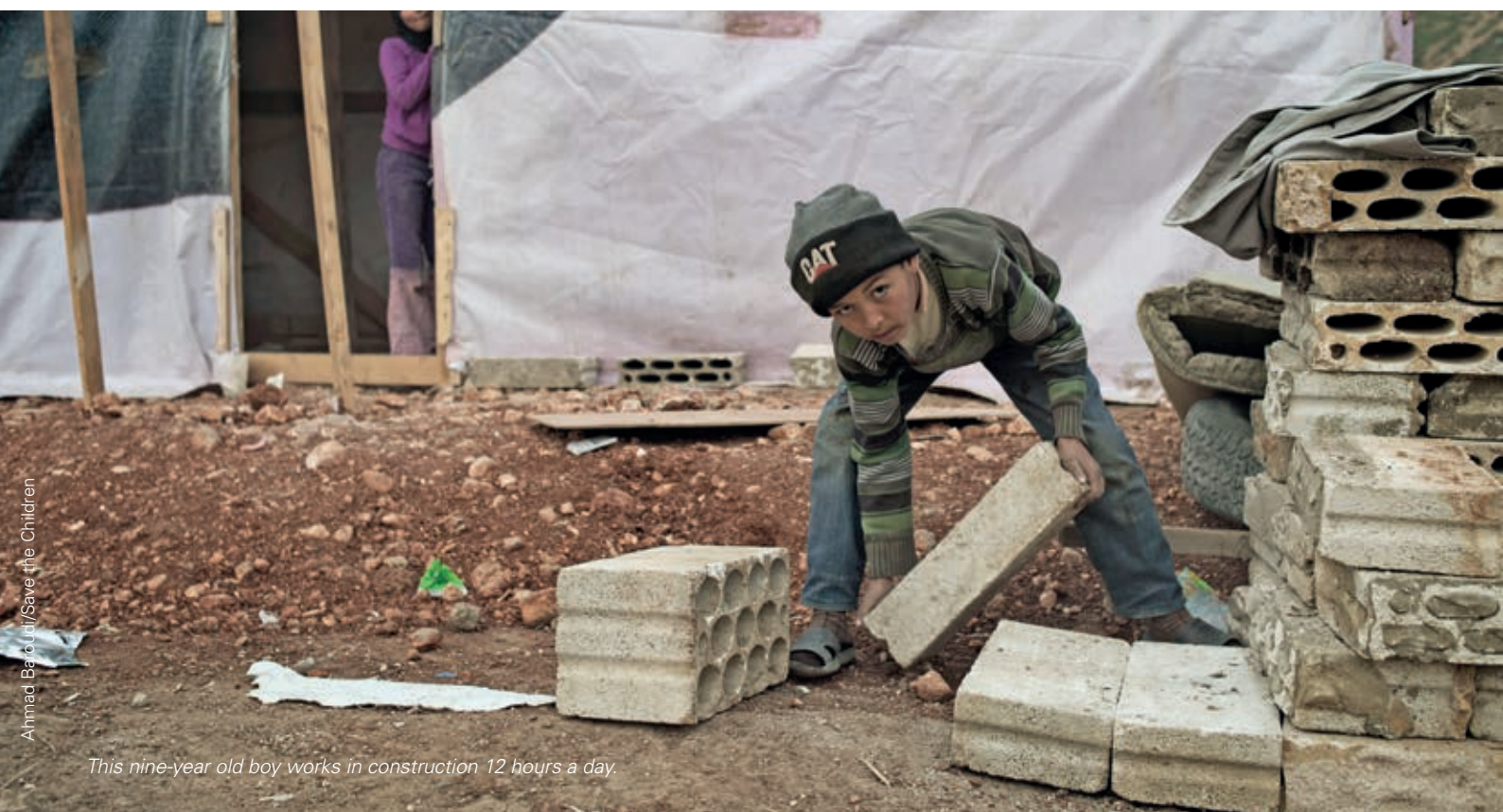
This nine-year old boy works in construction 12 hours a day.

Despite the lack of recent large-scale assessments of child labour, there is no shortage of evidence that the Syria crisis is pushing an ever-increasing number of children towards exploitation in the labour market. The data that are available are probably an under-estimate: Employers and vulnerable families tend to hide the problem, fearing the consequences of disclosing it. In the Za'atari refugee camp in Jordan, heads of households reported that 13.3% of children aged between seven and 17 years old were working. However, when children themselves were asked whether they had worked during the preceding week, a much higher percentage (34.5%) 12 said they had.