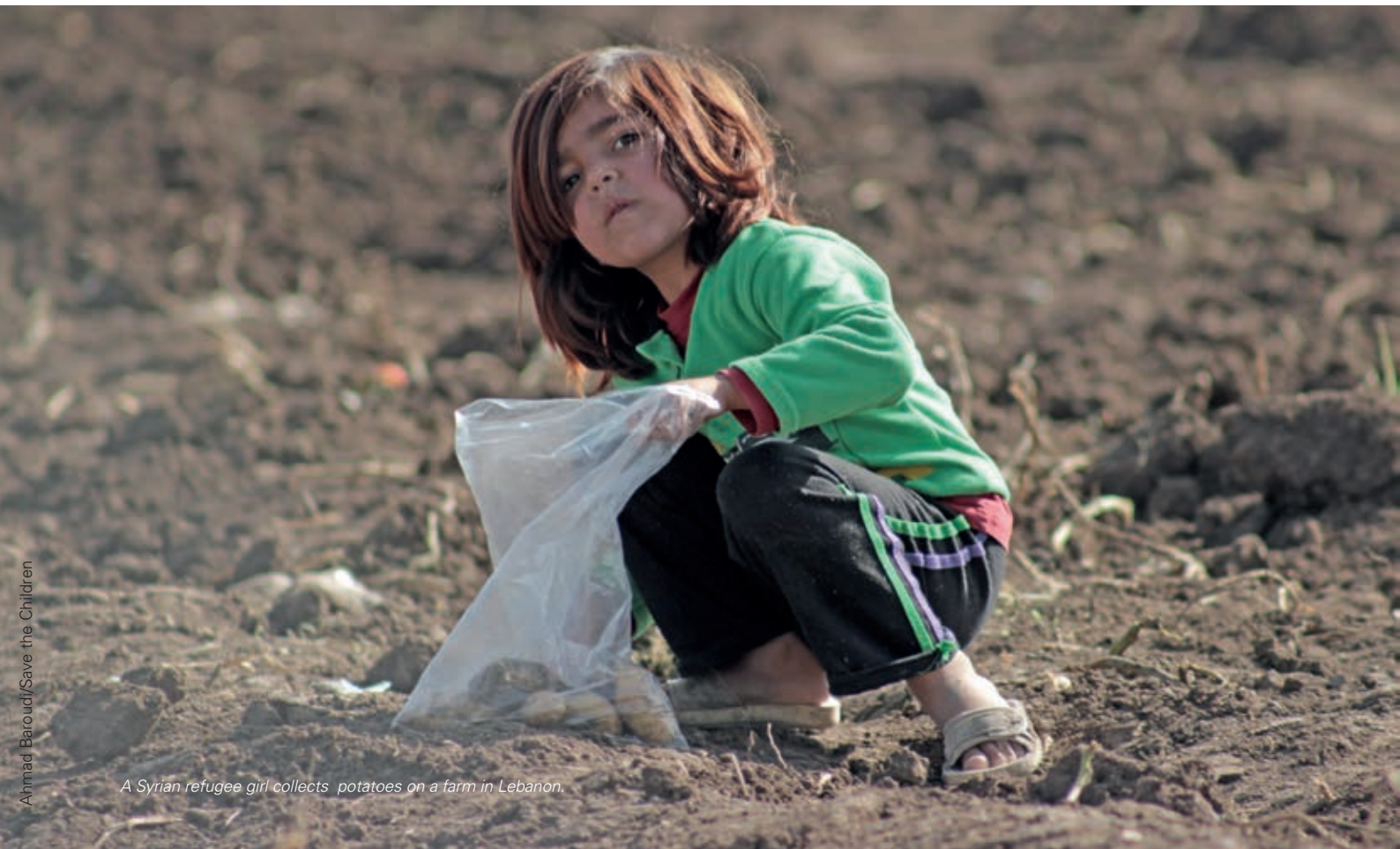
A Syrian refugee girl collects potatoes on a farm in Lebanon.

1 IN 3 STREET BASED CHILDREN IN LEBANON ARE GIRLS.